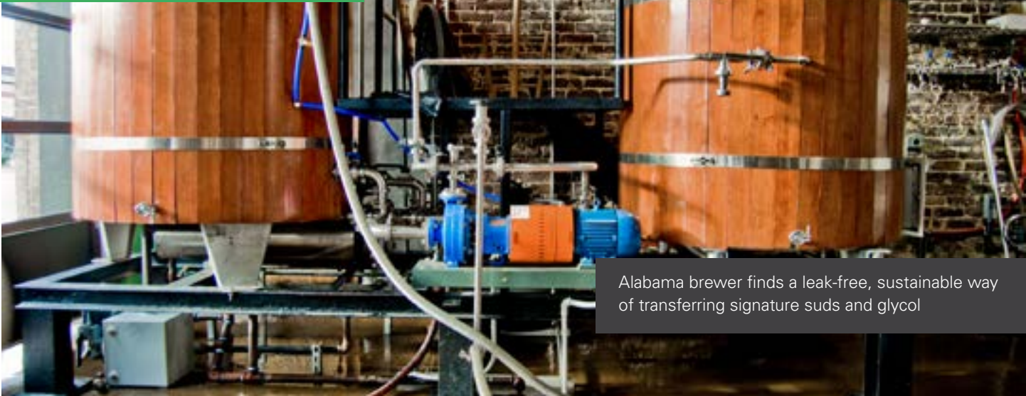
Alabama brewer finds a leak-free, sustainable way of transferring signature suds and glycol