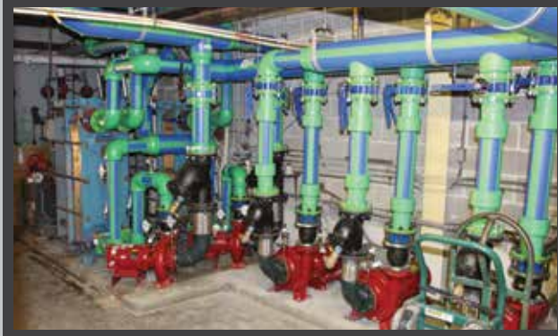
Corpus Christi Athletic Club, Corpus Christi, TX. Condenser water line retrofit.