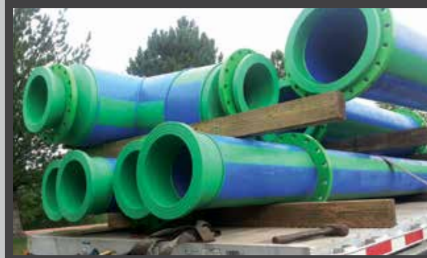
Essentia Health-Fargo, Fargo, ND. Chilled water/cooling tower project, 24-in. and down fabrication.