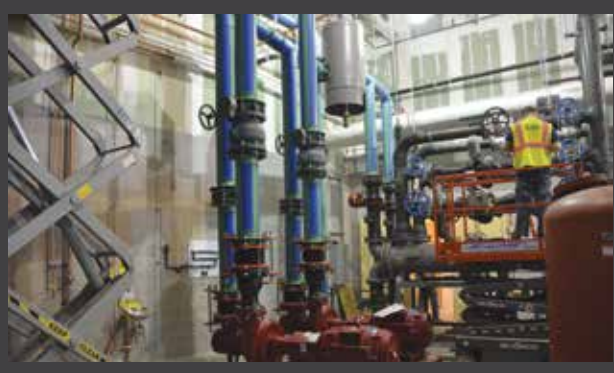
TCF Bank Stadium, Minneapolis, MN. Radiant field heating.

Los Angeles County Metropolitan Transportation Authority, Los Angeles, CA. 28-story chiller pipe retrofit.