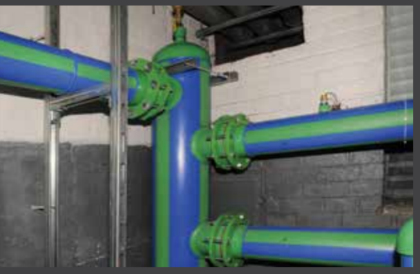
Crescent Apartments, East Rockaway, NJ. Hydraulic separator, boiler retrofit.