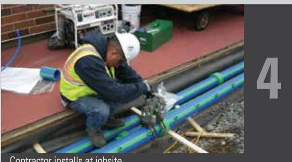
Contractor installs at jobsite