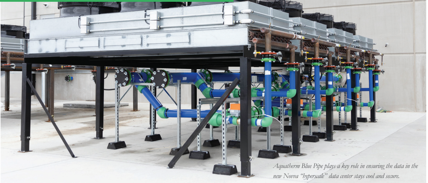
Aquatherm Blue Pipe plays a key role in ensuring the data in the new Novva "hyperscale" data center stays cool and secure.