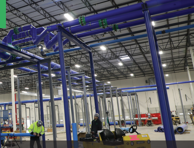
More than half a million square feet, 15,000 feet of Aquatherm piping, 3.6 billion nitrile gloves annually . . . everything about the American Nitrile warehouse-to-manufacturing-plant conversion is big.