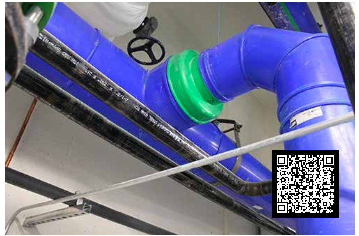
PROJECT Bozeman Health Hospital