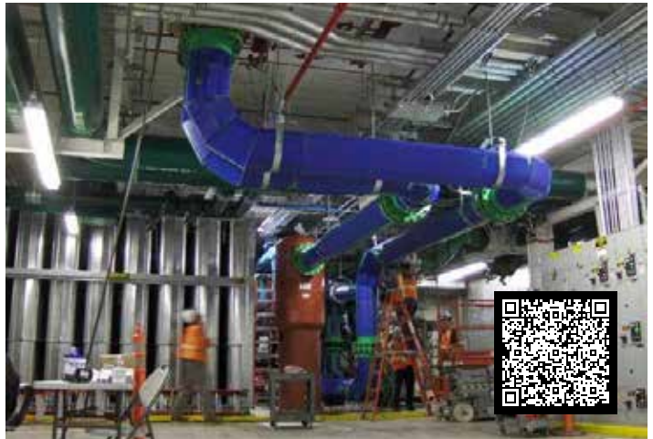
PROJECT Lawrence Livermore National Laboratory