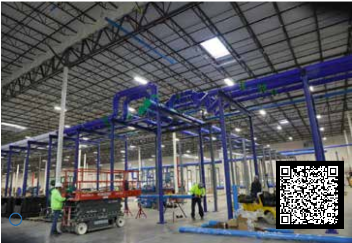
PROJECT American Nitrile Manufacturing Plant

Check out these aquatherm projects by scanning the code or visiting https://bit.ly/3RuvnUd